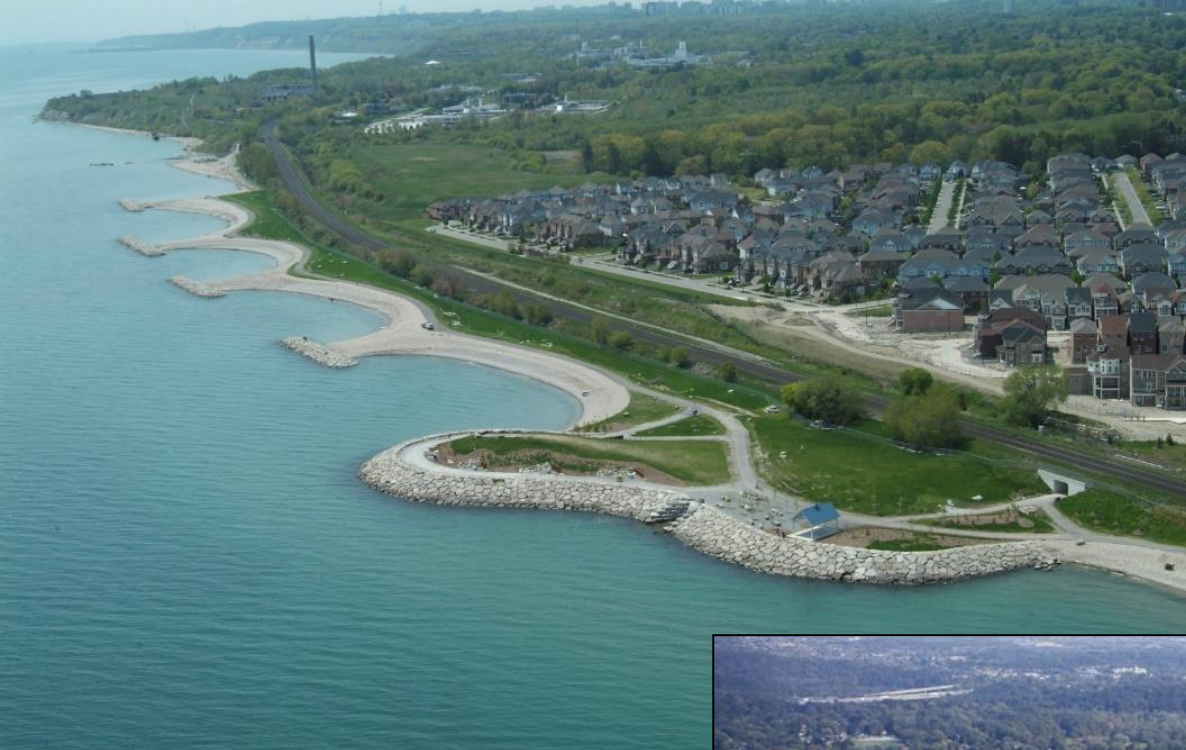
Port Union – Phase 1