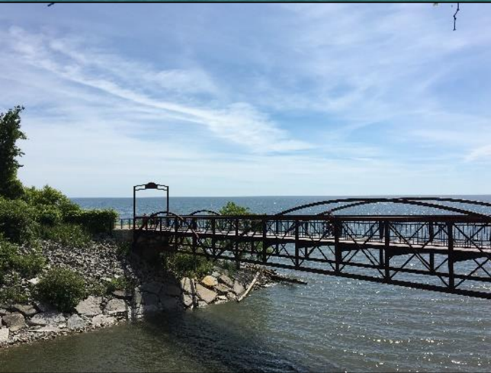
Highland Creek Bridge